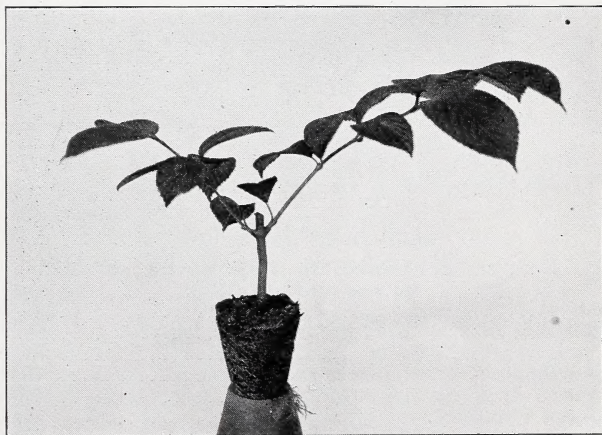
VIBURNUM PLICATUM (3-in. pots)